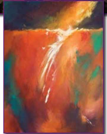
A Release - giclées and prints available at DesignStudios-Inc.com

Reminder: The April Bulletin will not be sent out by regular mail unless we hear from you. Please use the enclosed response form and we will be happy to send the Bulletin to your house.