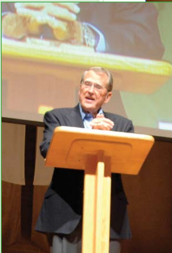
RT Kendall: How to Forgive Ourselves—Totally