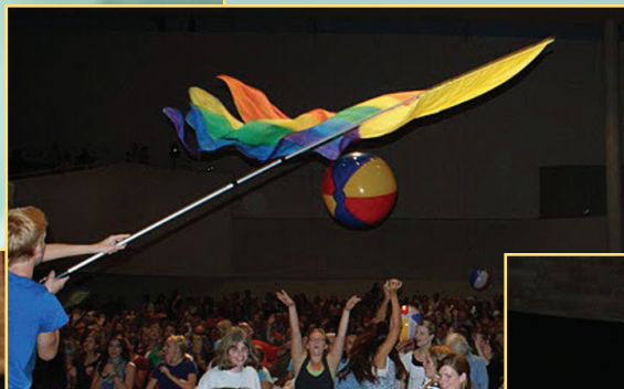
Friday evening worship