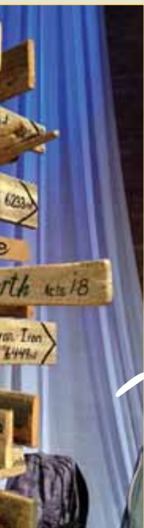
" created by