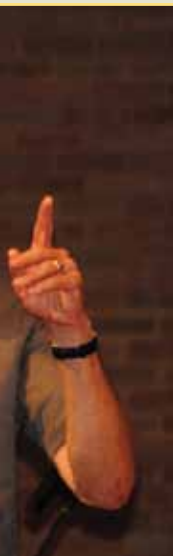
g. The tiful feet"